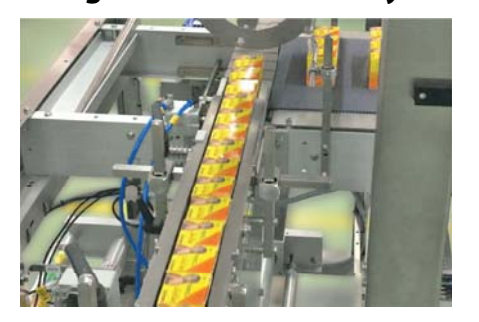
Single / Multiple track operation